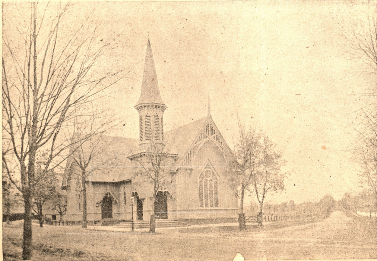
ARCHER MEMORIAL METHODIST EPISCOPAL CHURCH

This Paper will be published in connection with the