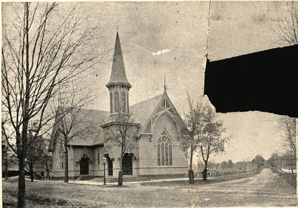
ARCHER MEMORIAL METHODIST EPISCOPAL CHURCH.

The Ladies' Aid Society of Archer Memorial Methodist Episcopal Church will hold their