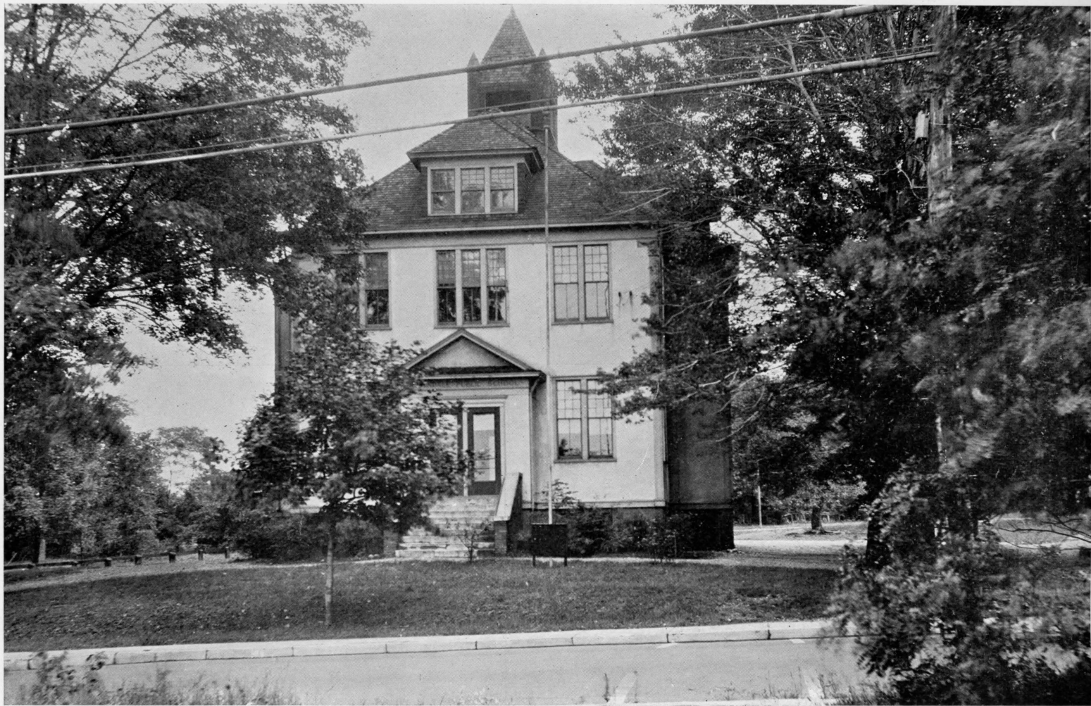
ALLENDALE PUBLIC SCHOOL—1896 TO JUNE, 1929