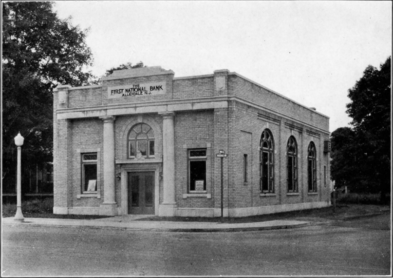
FIRST NATIONAL BANK ALLENDALE, N. J.