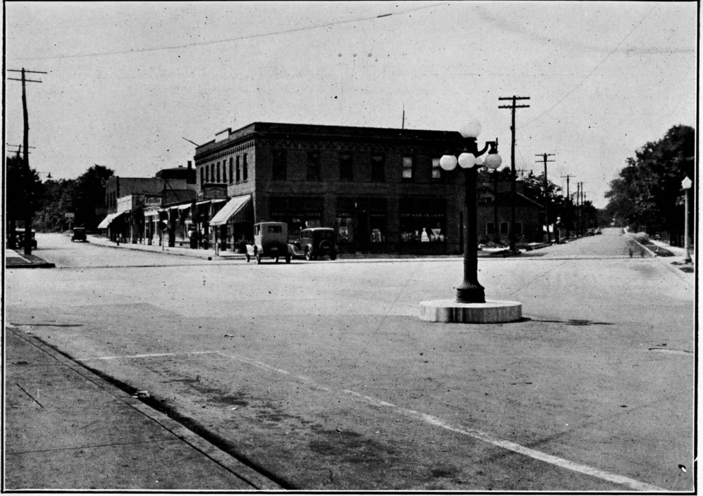
PLAZA SQUARE LOOKING WEST