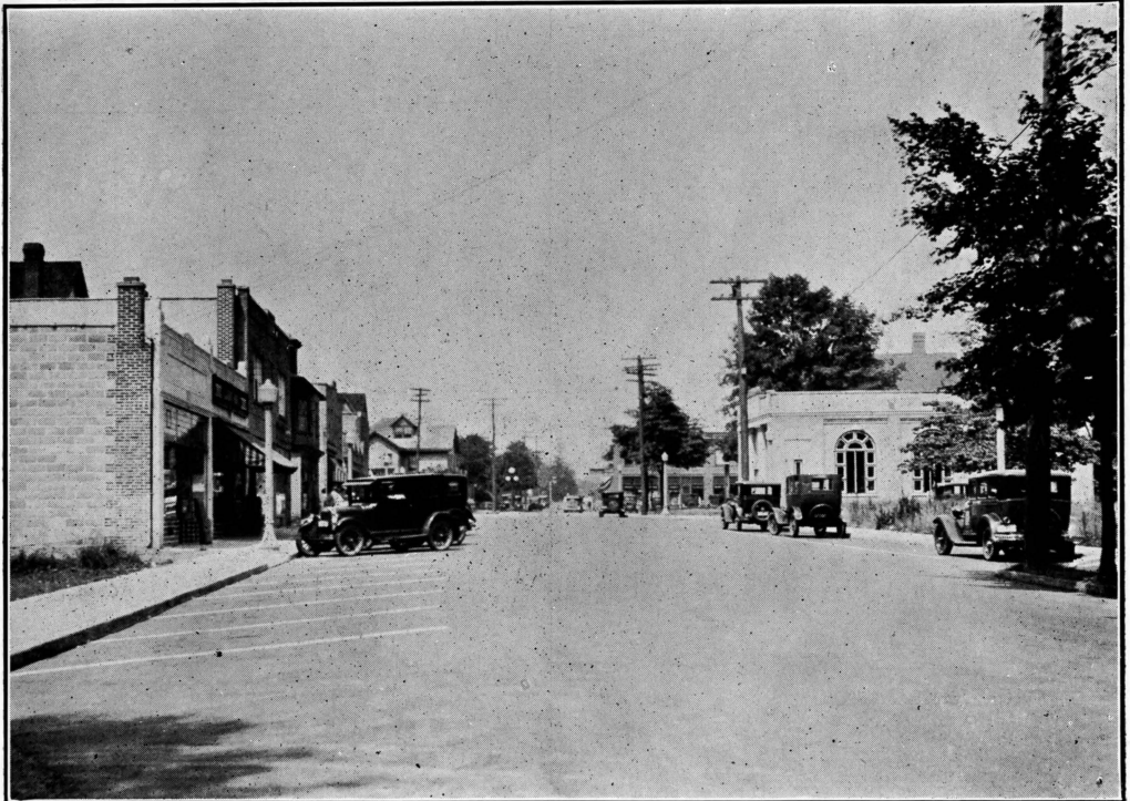
W. ALLENDALE AVE. LOOKING WEST