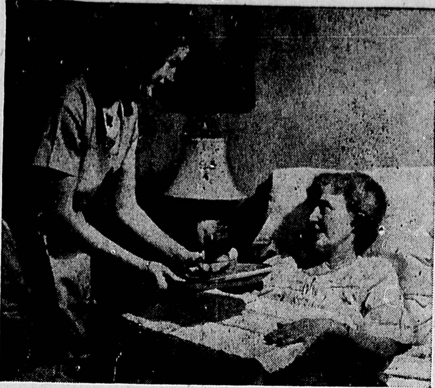
Like many other young people, this high school senior is learning home nursing—a job many of us are faced with sooner or later. She has improvised a tray-table from a cardboard box. The Red Cross offers home nursing courses in its chapters and in many schools.