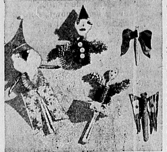
Above, a flesh brush is used to create an amusing Santa, a men's hair brush for a Snow Man, a lady's hair brush for a Ballet Dancer and tooth brushes for angels.