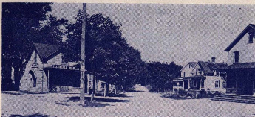
These two houses, right, beyond that store, on Myrtle Avenue burned to the ground Christmas Day, 1909. Men of the community got together Christmas night to begin formation of a volunteer fire department.