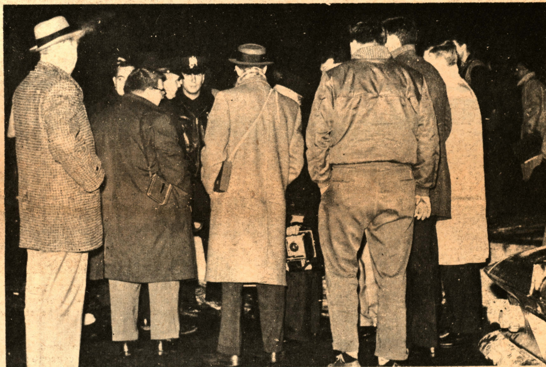
POLICE, CAMERAMEN, REPORTERS and curious citizens are all mingled in this picture, showing some of the assemblage in the vicinity of Crestwood Lake shortly after the capture of Michael Salvi.