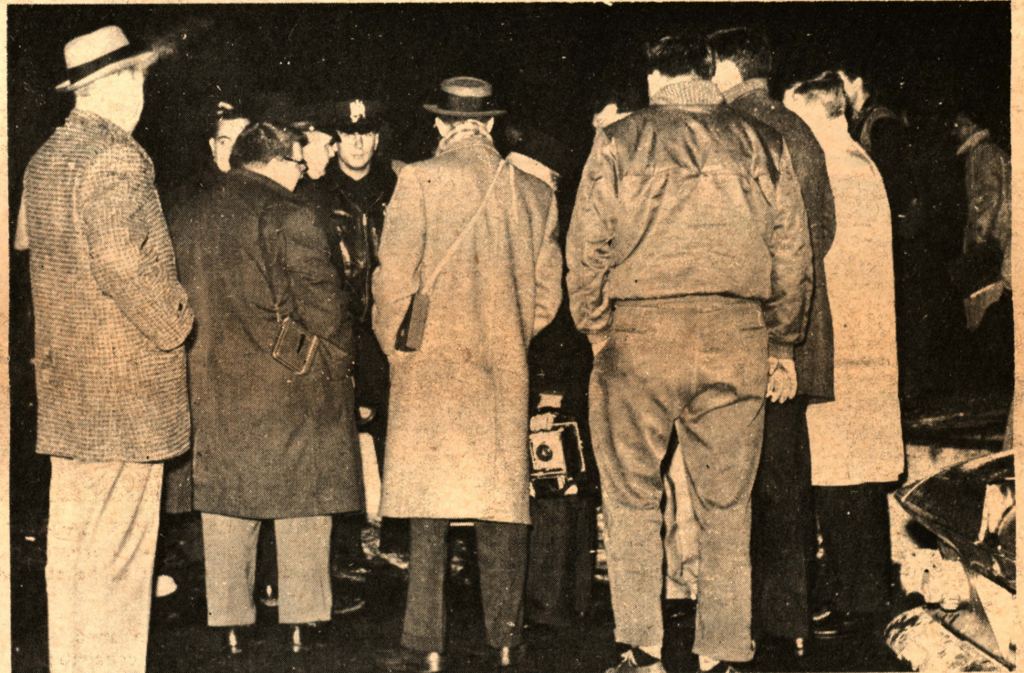
POLICE, CAMERAMEN, REPORTERS and curious citizens are all mingled in this picture, showing some of the assemblage in the vicinity of Crestwood Lake shortly after the capture of Michael Salvi.