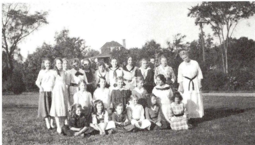
Girls' Patriotic League, about 1918. See page 4 of this issue for identifications.