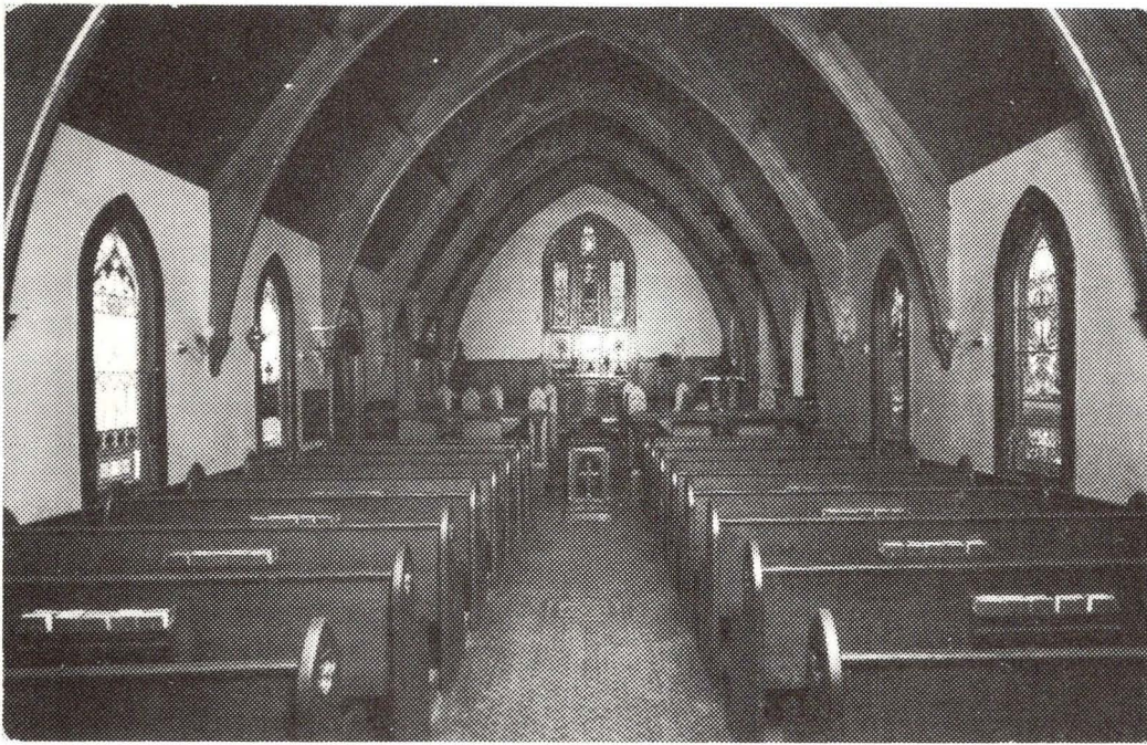
Interior of the Church of the Epiphany, about 1920.