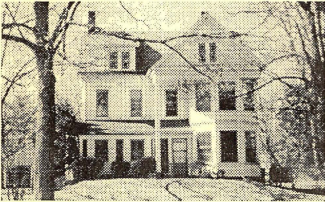
37 East Allendale Avenue, Photo taken March 1987