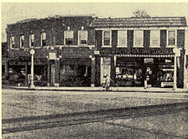
The United Cigar Store (right), 101 West Allendale Avenue, from a post card circa 1930.

Some bits and pieces about some of Allendale's businesses—past and present. We know that this list is incomplete and hope that some of our readers can add information.