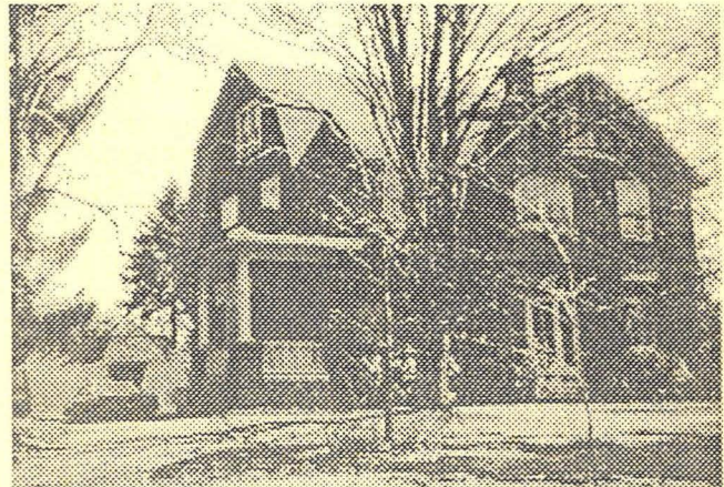
54 East Allendale Avenue, Photo taken March 1987

The Bergen County Historical Sites Survey of 1983 describes the house as residential, early 20th century Colonial Revival-Dutch Colonial-Arts and Crafts style, one with two in roof. The first story has 3 bays with multi-paned one-on-one windows and a gambrel roof. The north facade has a 3 bay porch with cobblestone piers and rail, pair of wood Tuscan columns, wood rail and frieze under hipped north end of porch. Glazed doors lead to main entrance. The roof has a large gable dormer and smaller shed dormers.