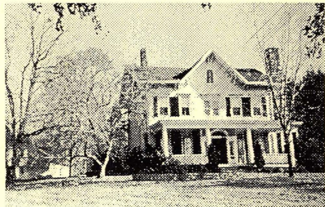
144 East Allendale Avenue, photo taken March 1987