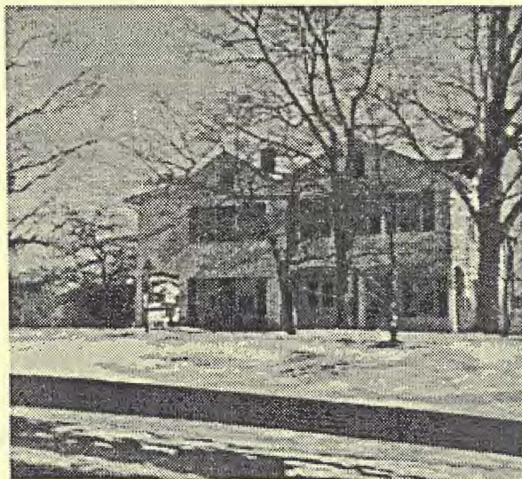
2 East Crescent Avenue, photo taken about 1970

(continued from the February 1991 issue)