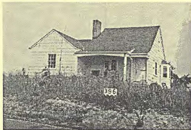
34 East Crescent Avenue, 1940 Tax Appraisal Photo