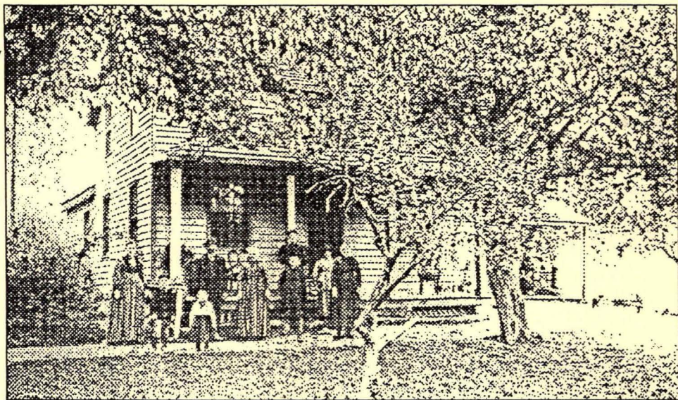
The Quackenbush House at 754 Franklin Tpk., Allendale, in a photograph taken in 1885.