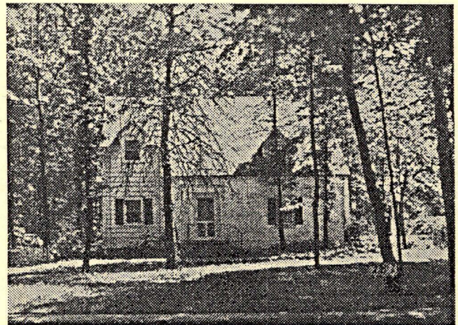
50 East Orchard Street, 1940 Tax Appraisal Photo

On 16 October 1948 Lot 1B was acquired, and circa October 1952 the garage was converted into a room; another bathroom was added, and a new garage was built.