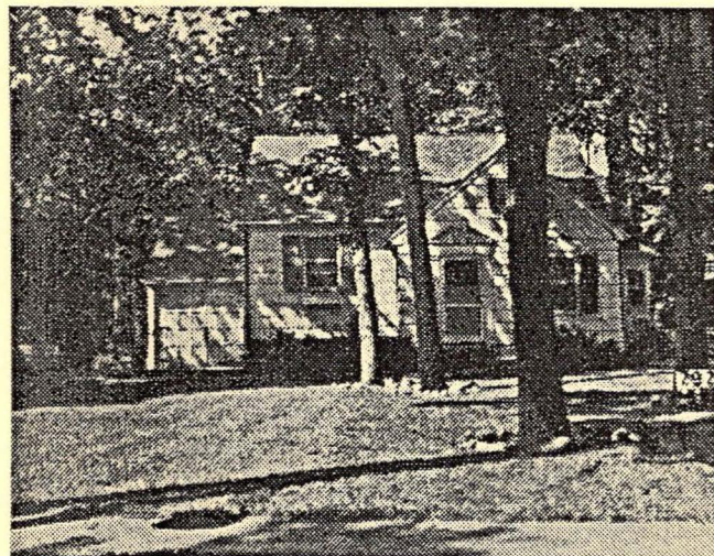
79 East Orchard Street, 1940 Tax Appraisal Photo