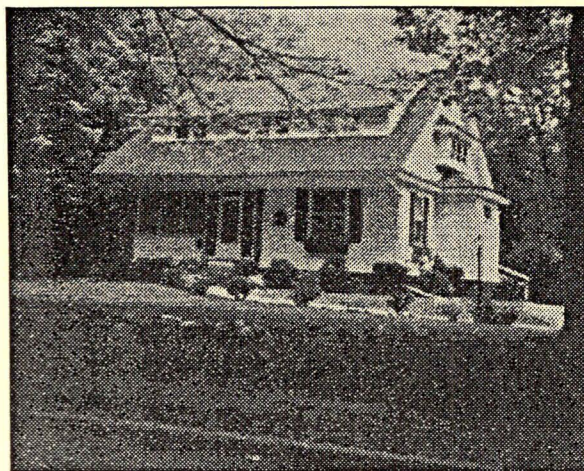
126 East Orchard Street, Photo taken June 1987

The Parish Messenger of the Church of the Epiphany in its July & Aug. 1908 issue reported: "Mr. Smith's house in Walton Park is gradually approaching completion and will be a very handsome one when finished."