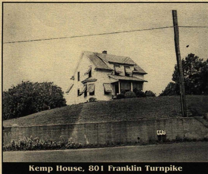
Kemp House, 801 Franklin Turnpike

The 1940 Borough Tax Appraisal Sheet describes the house as a 2-story, 1 family house. It had a clapboard exterior. It had a detached garage. The house contained 6 rooms, and 3 bedrooms. The fair market value was $4,750.