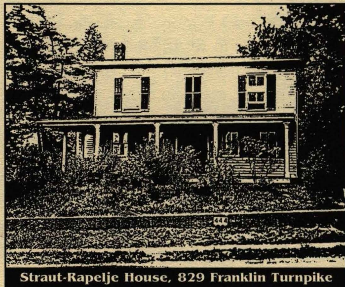
Straut-Rapelje House, 829 Franklin Turnpike