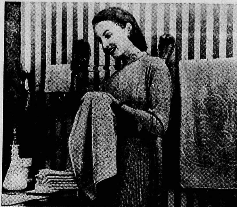
Viewing your bathroom through the eyes of guests is a big help in improving its appearance.

IT'S EASY to have a bathroom you're proud of when guests visit your home. Even on a limited budget, you can achieve an attractive effect. The first step is to see your bathroom through the eyes of guests, suggests The Cannon Homemaking Institute. Stand at the door and pretend you're looking at it for the first time. Viewed in this way, several improvements will occur to you—because you're seeing it with new eyes.