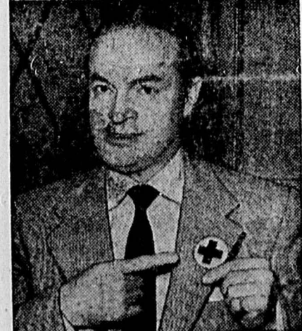
Bob Hope, Red Cross radio star, points to the button he is wearing "to remind others."

KERWICK - MILLER, INC. Your Studebaker Dealer Main St. & Wyckoff Ave. Wy 4-0900 Wyckoff, N. J.