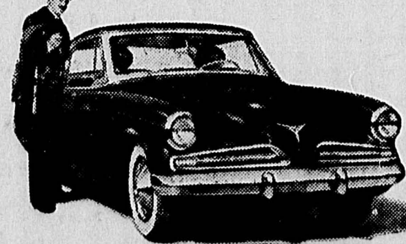
It's less than five feet high! 1953 Studebaker Starliner hard-top convertible! Truly a new sight into the future!

It's almost unbelievably low! It's impressively long and wide! It has the sleek-lined smartness of a costly foreign car and it's right down to earth in price!