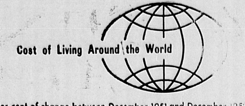
Per cent of change between December 1951 and December 1952

SPECIALS (Complete Cabinet, Sink Faucets) reg. now 66" Double Sink $160.00 124.50 54" Sink 115.00 89.50 42" Sink 98.00 76.00 42" Sink & Tub 124.00 97.50 VISIT OUR SHOWROOM OR HAVE OUR REPRESENTATIVE CALL *CUSTOM TILE WORK (Open Thurs. to 9 p.m.) U. S. STEEL TILE CO. 334 Main Street, Paterson MU. 4-5532