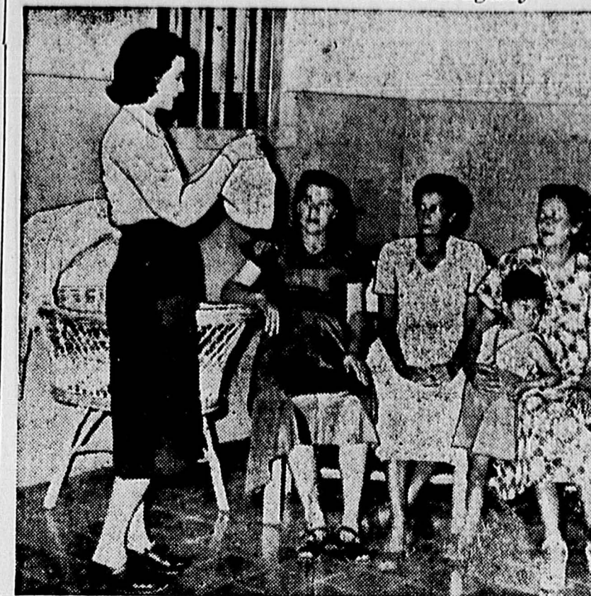
MOTHERS and expectant mothers watch a demonstration of child care, given by a public health nurse in a small town clinic in Paraguay. The clinic receives aid from the United Nations International Children's Emergency Fund, which had a large share in getting the center, of which there soon will be 10, into operation.