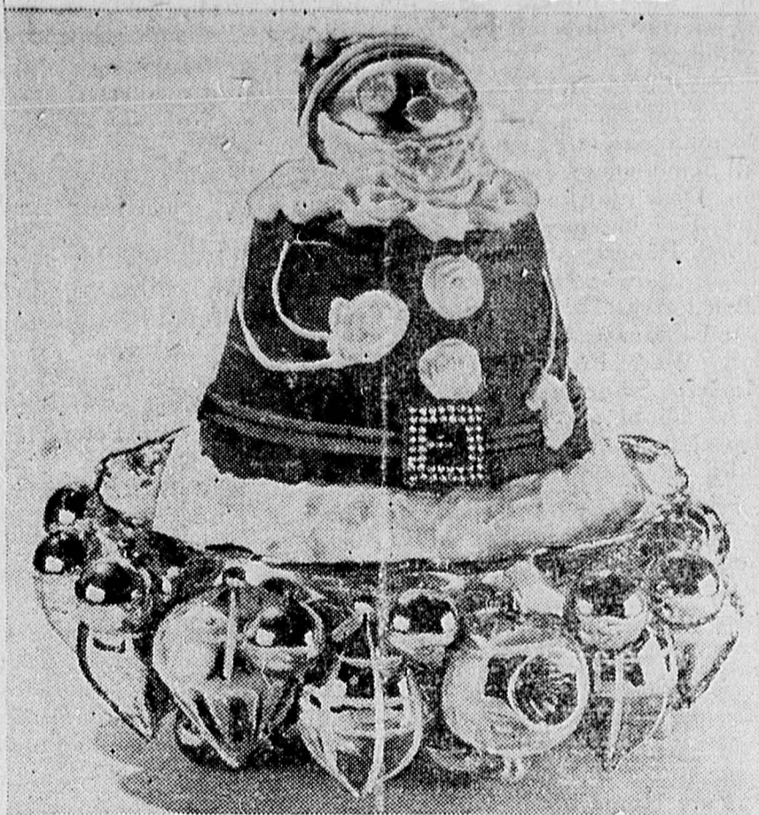
THIS JOLLY SANTA CLAUS cake makes a luscious centerpiece for your holiday table. It's the December Woman's Home Companion cover cake and is easy to make from their recipe and decorating instructions. Santa is put together with two angel cakes—made from angel-food cake mix or your own recipe—one in a 9-inch pan, the other in a 7-inch pan. Frosting for his suit is tinted red with food color. Green and red gumdrops make eyes and nose; string licorice the belt; silver dragees for the buckle. The head is a Christmas ball capped with red frosting.